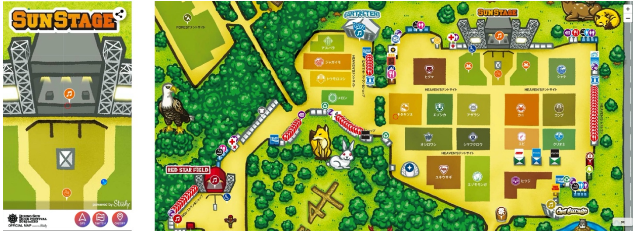
[ Example of online map powered by Strolly - Music festival, RISING SUN ROCK FESTIVAL in Japan ]

recommendations, and locations of sponsor booths with Landmark pins to move smoothly from one place to the other.